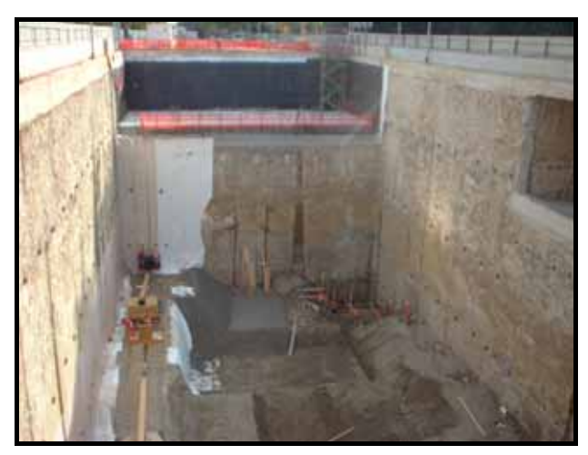
Figure 10 – Ponale station pit

There are 9 stations along the M5 line: Bignami, Ponale, Bicocca, Ca' Granda, Marche, Istria, Zara, Isola and Garibaldi. Of these, Ponale, Bicocca Ca' Granda and Marche saw the use of the TBM and therefore present a central body in tied slurry walls; the excavation is about 22.0 m deep from ground level. The exits (that access the side roads) are at a higher level and were later built with provisory bulkheads in micropiles and sheet piles.