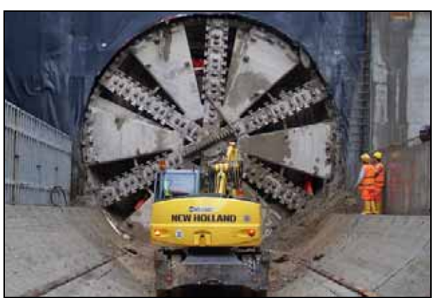
Figure 5 - TBM before passing through the excavated station

A conveyor belt (437.5 m outside of the tunnel and about 3,420 m inside the tunnel) was used to extract the bored rock, transporting the muck to two pre-prepared pits.