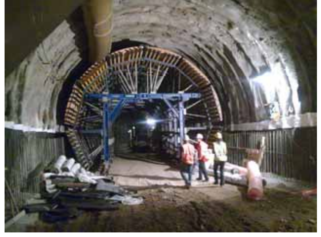
Figure 9 - Conventional excavation (widening at Zara Station)

The tunnels were excavated and coated completely for an extension of at least 6 m and without inconvenience to the overground traffic and structures.