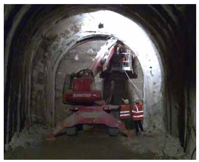
Figure 7 - Conventional excavation (single track tunnel)

A precoat in metal centrings and shotcrete was applied while advancing, each section was then completed with a final coat in reinforced concrete.