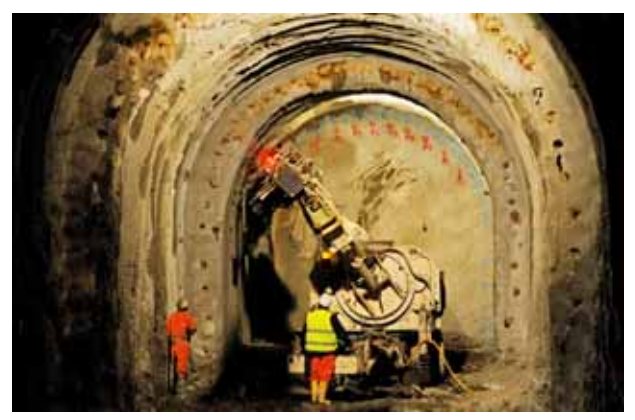
Figure 8 - Conventional excavation (single track tunnel)

In this route the biggest difficulties occurred near the interference with the Line 3 Zara station, since situations arose (during the excavation for the single track tunnel) that hadn't been foreseeable during the project phase.