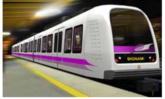
Figure 1 - M5 train

The line 5 is a fully-automated and mediumcapacity rail transport system. Personnel will not be on-board nor in the stations, but will instead travel on the line providing assistance to passengers, checking tickets and guaranteeing safety.