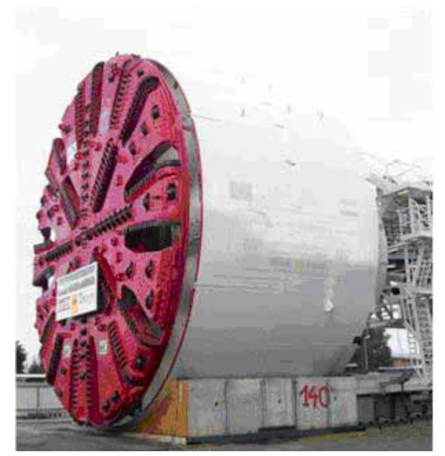
Figure 3 - TBM

An EPB TBM was chosen after considering the types of ground to bore so as to contain ground subsidence and to avoid repercussions on existing structures. This type of TBM is kept in balance by the pressure of the same excavation material, thus solving three problems at the same time: