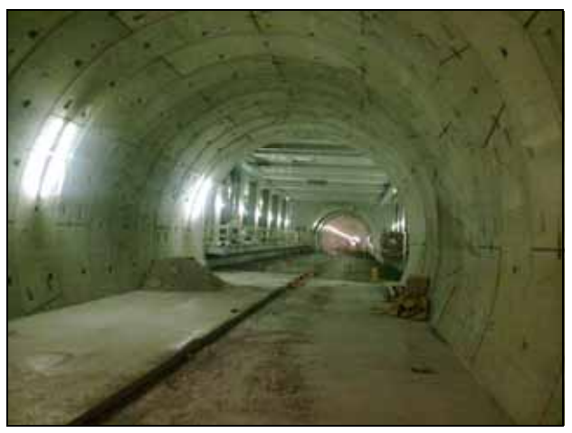
Figure 6 - Artificial TBM bored tunnel

Cementing mortar was pressure-injected behind the rings to fill the space between the blocks of concrete and the bored profile.